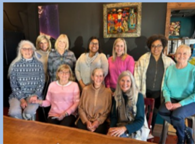
Women's Fund of the Blue Ridge Outreach Committee

Women's Fund of the Blue Ridge believes that all women have the right to equality, safety, opportunity and self-determination in every aspect of their lives. We recognize our role as a leader in this community by working to achieve these principles through our grant making, advocacy and community building.